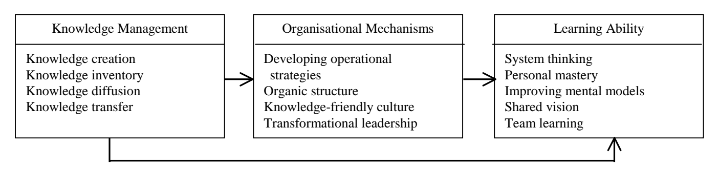
Figure 1: The framework of a learning organisation constructed from the results of the interviews.

According to the results of the interviews, the researchers built a learning organisation framework for engineering education in universities, as shown in Figure 1.